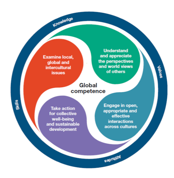
Figure 1.Dimensions of Global Competence

Even though no question tests factual knowledge (for example, there will be no question on the projected sea-level rise by 2030), students' background knowledge of the issue described in the scenario is an important mediator of performance on the test. While